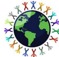
Cross Cultural Sensitization